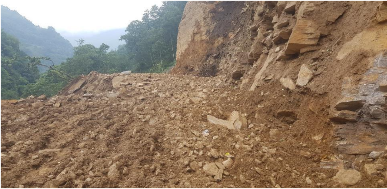
Figure 6.13:Track Widening for pipeline alignment after rocky cliff.