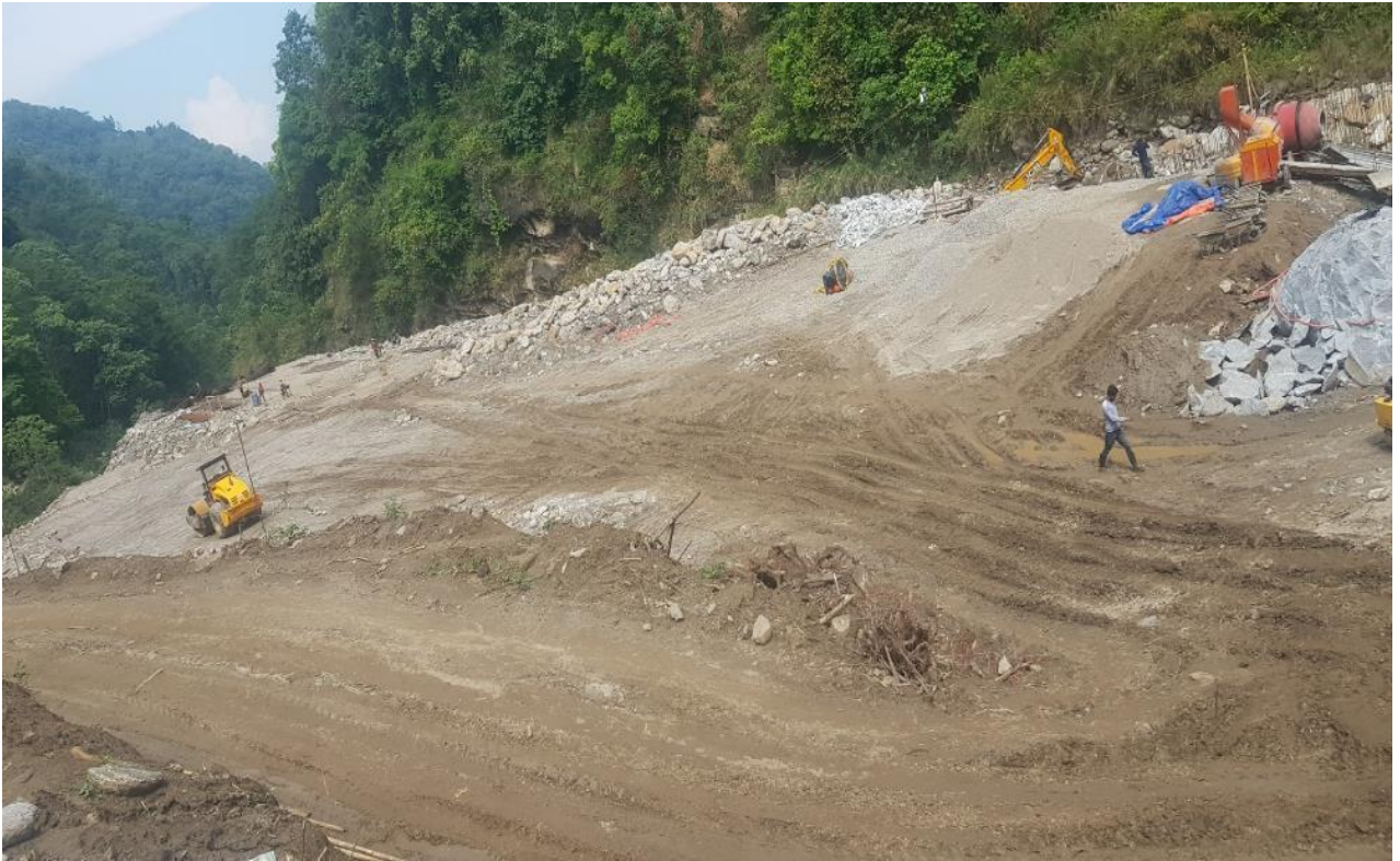
Figure 6.11: Gravel trap and desander inlet base preparation