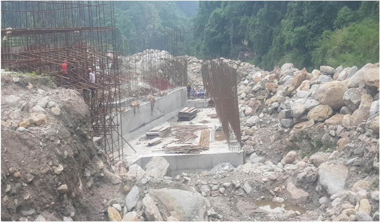
Figure 6.3: Undersluice upstream bay and divide wall.