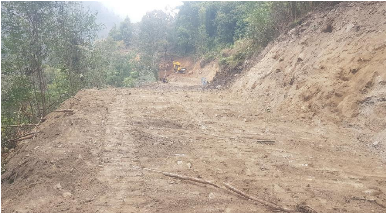
Figure 6.17: Track widening for waterway alignment.