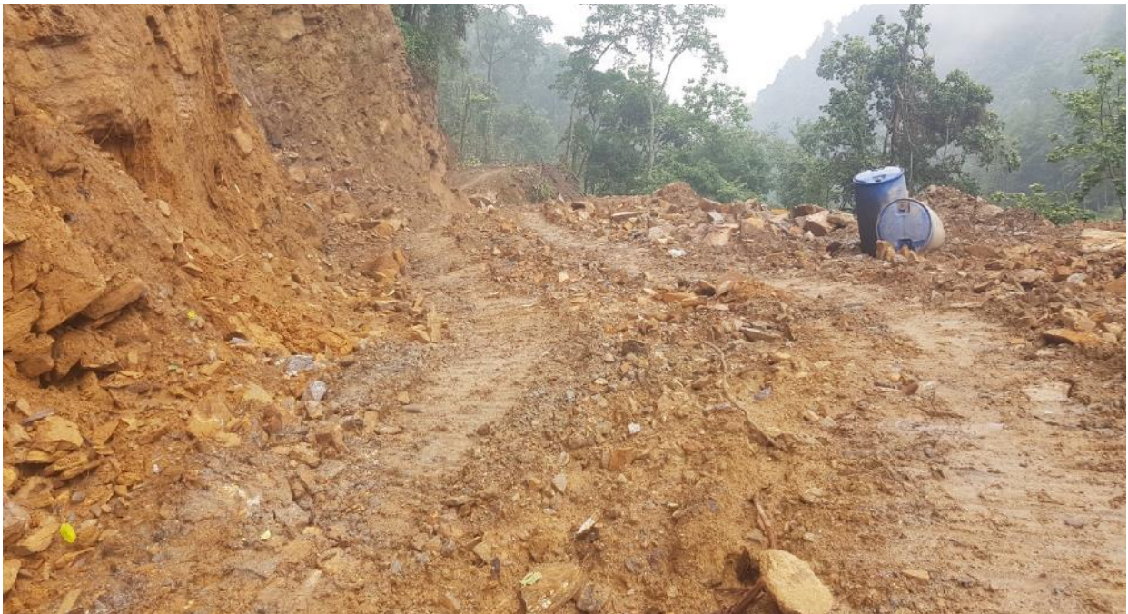
Figure 6.14:Track widening for pipeline alignment