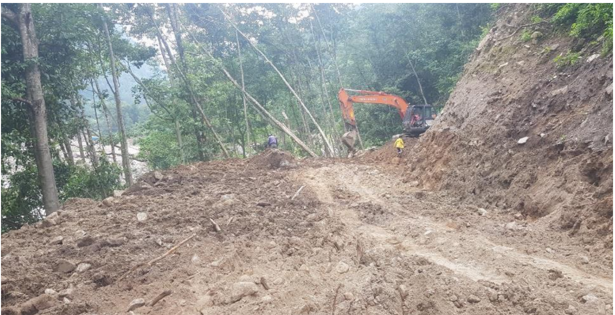
Figure 6.12: Track Widening for pipeline alignment from desander downstream side.