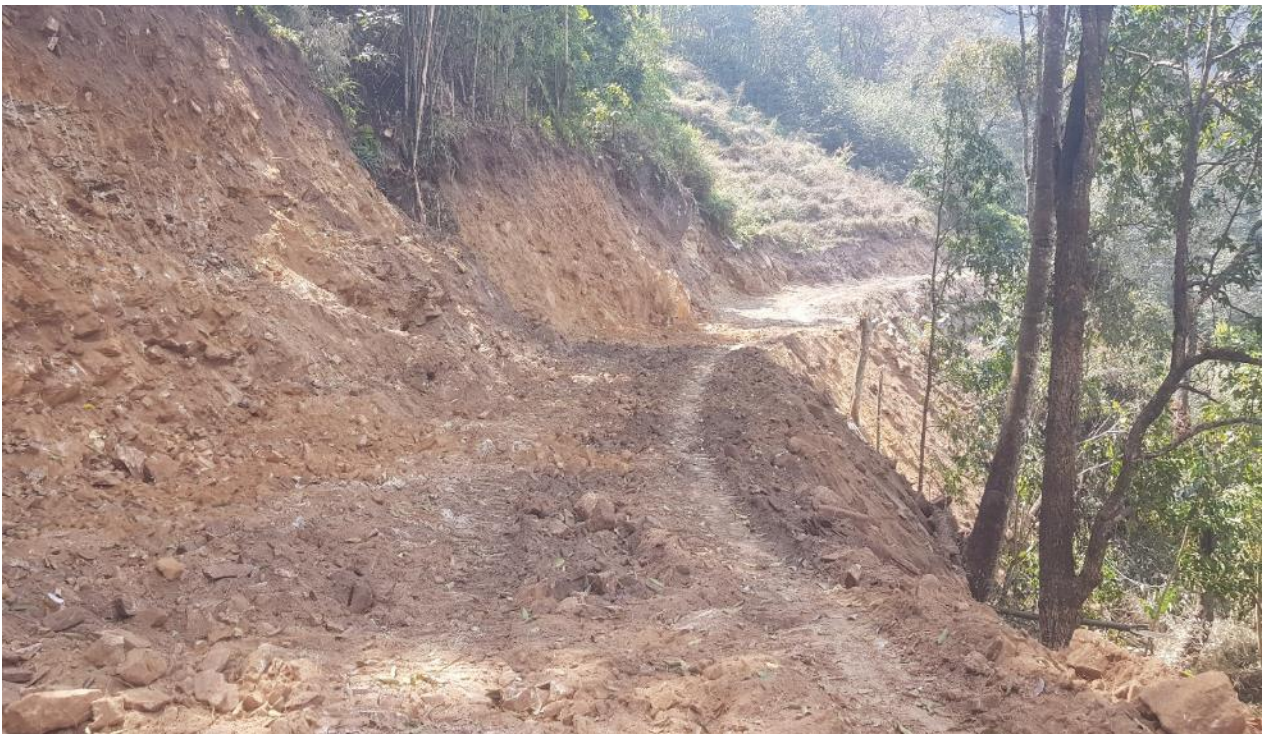
Figure 6.16:Track Widening for pipeline alignment.