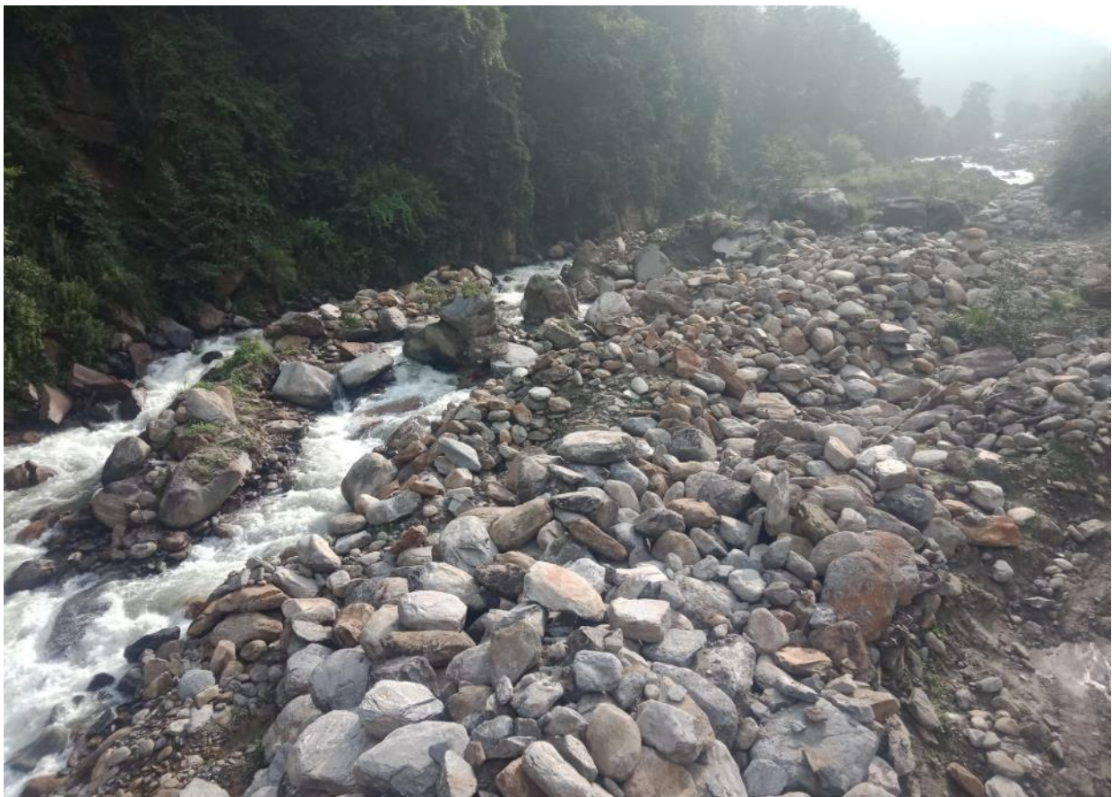
Figure 6.10: River training works upstream of headworks.