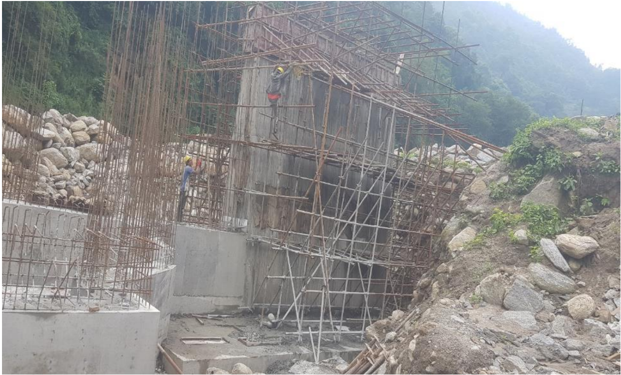
Figure 6.5: Guide wall panel -2 after final concreting.