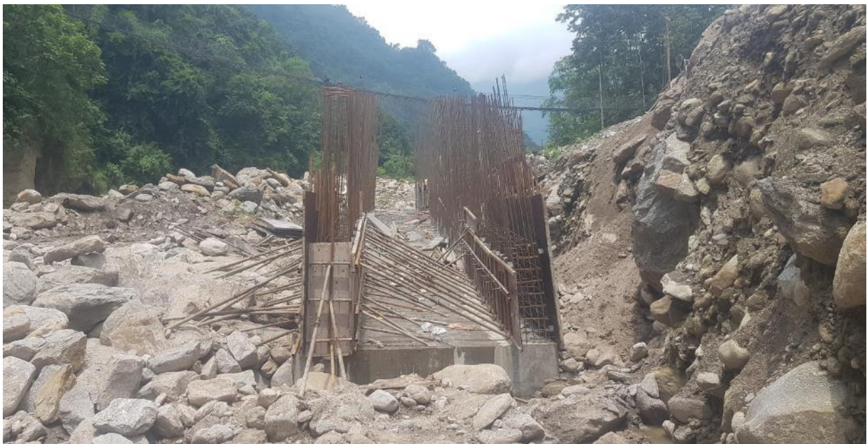
Figure 6.2: Formworks at Undersluice wall from downstream