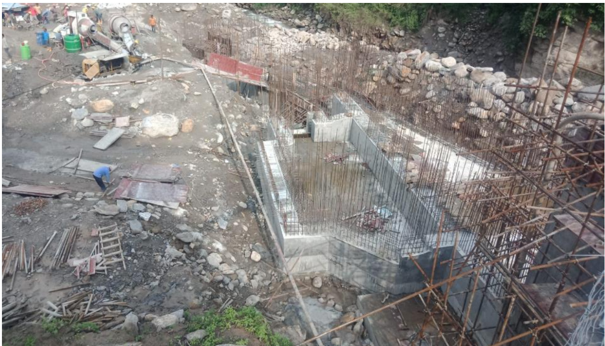
Figure 6.6: Intake base slab and wall.