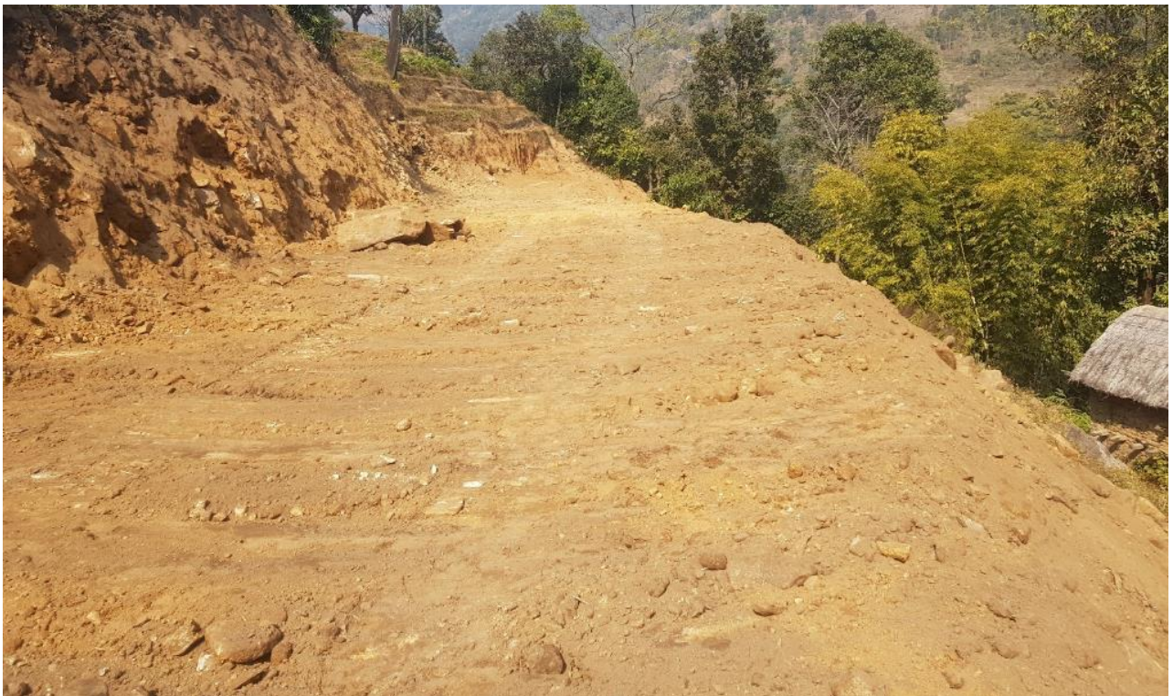
Figure 6.18: Track Widening for Headrace Pipeline Alignment