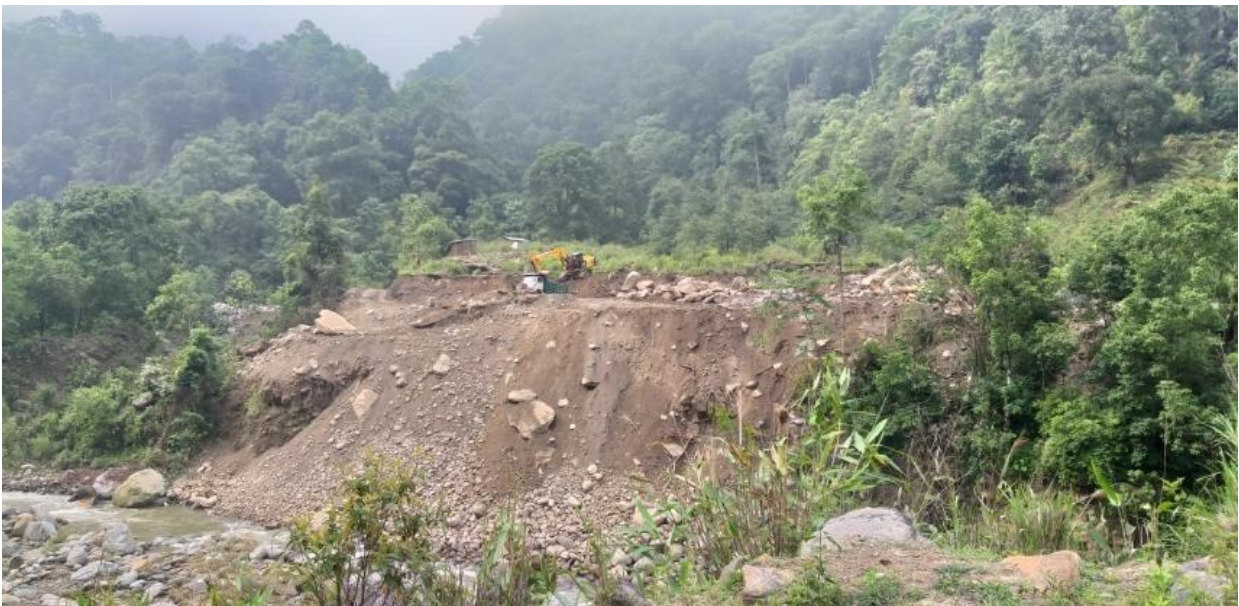
Figure 6.20: Powerhouse excavation work.