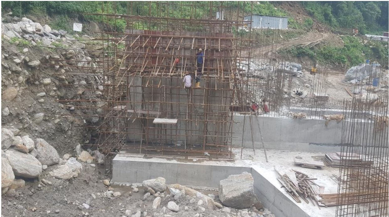
Figure 6.4: Guide wall and undersluice upstream slab from river side.