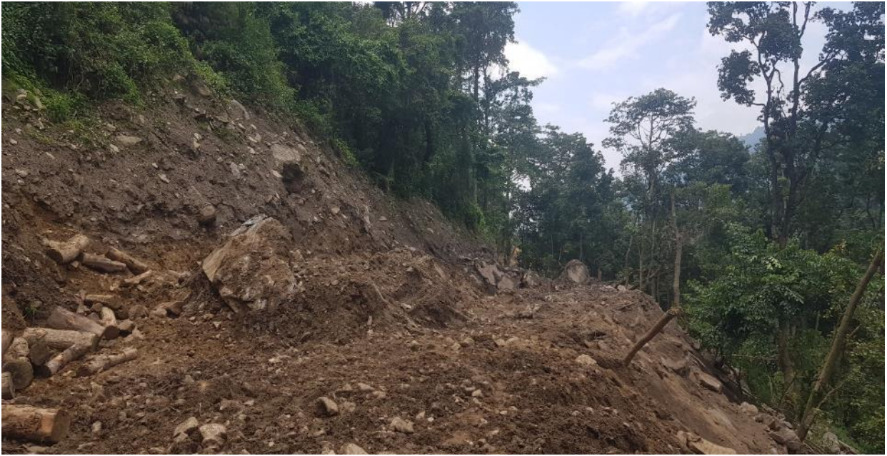
Figure 6.15:Track Widening for pipeline alignment.