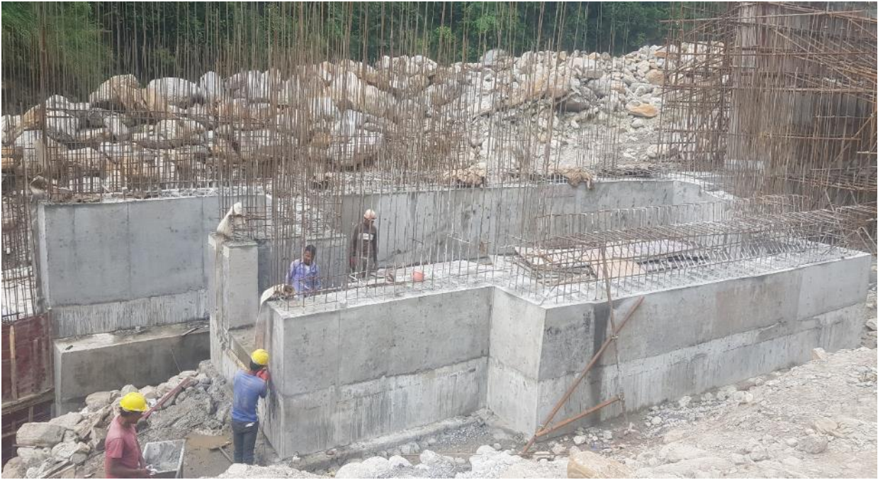
Figure 6.7: Cobble flushing gate structures along with Intake shear wall.