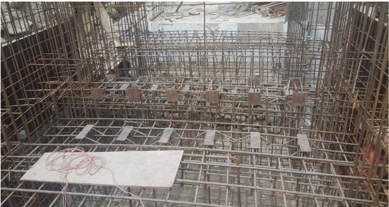
Figure 6.8: Installation of first stage embedded parts at undersluice gate and stoplog.