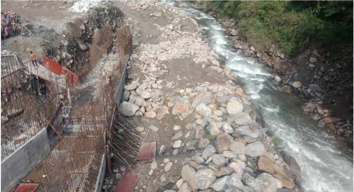
Figure 6.1: Undersluice slab concreting.