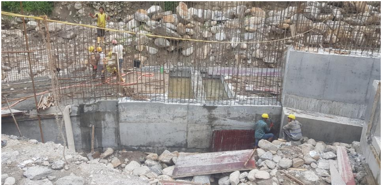
Figure 6.9: Gate grooves after concreting.